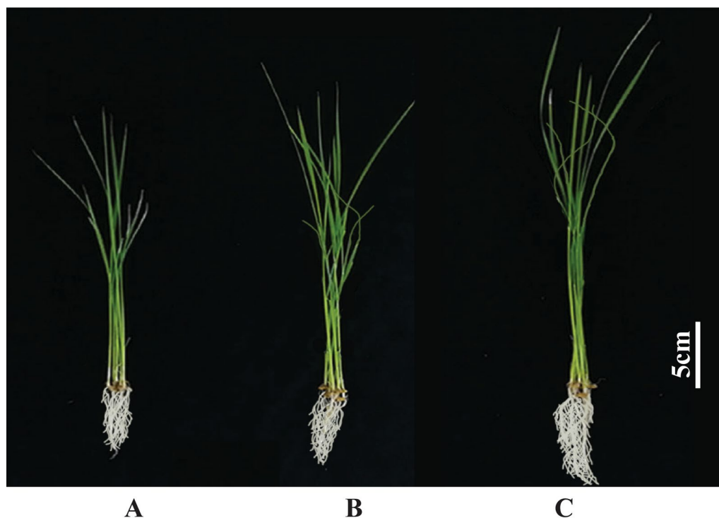
Fig. 2 Effects of inoculating with PGPE bacteria on the growth of shoots and roots in rice seedlings after treatment for 15 days. A Control (non-inoculated), B Rice seedlings inoculated with strain ND06, C Rice seedlings inoculated with strain ND10

antifungal activity over the M. oryzae fungus under in vitro conditions. Consistency with some previous studies, which demonstrated the bacteria inhibited the fungal growth by some mechanisms such as the production of bioactive compounds like extracellular lytic enzymes, siderophores, salicylic acid, antibiotics, and volatile metabolites (De Hita et al. 2020). In addition to direct antagonism, the result of the pot experiment also showed that the inoculation of ND06 or ND10 significantly suppressed rice blast in tested seedlings. These results might explain due to the production of bioactive compounds that induced systemic resistance by potentially regulating defense-related genes in salicylate (SA)- or jasmonate (JA)-dependent defense signaling pathways (He et al. 2019). In this study, the results indicated that fungal antagonists produced IAA and siderophore that could play roles in inhibiting fungal growth.