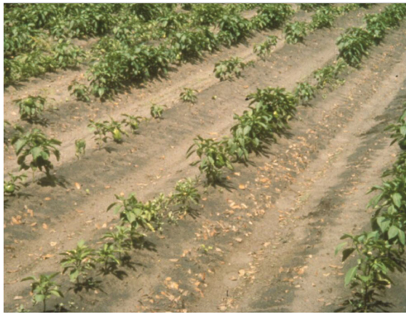
Fig. 2 A pepper field showing patchy areas in the form of stunting and seedling mortality due to root-knot nematode ( Meloidogyne spp.) infestation (Noling 2019)

seriously hampered in their main functions of uptake and transport of water and nutrients. At season end, the infected plants do not flower normally and therefore produce poor quality fruits. Moreover, infected pepper plants are more vulnerable to get drought damage. Rootlets are almost completely absent at severe infestation which may render plant death. Infection by additional subterranean pests and/or pathogens may extend plant damage to further roots. Eventually, plant damage and yield loss are based on nematode population level, the degree of host suitability, production practices (e.g., Abd-Elgawad 2019a), and biological and environmental conditions.